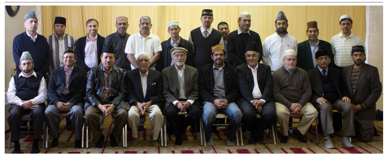
A group photo of Anṣār of York Majlis